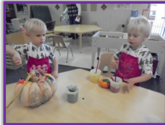
Painting big pumpkins.