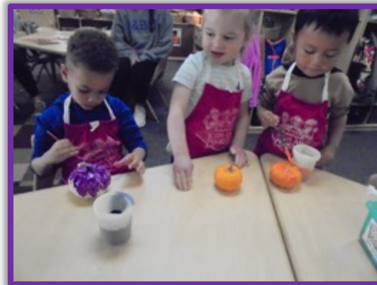
Painting small pumpkins.