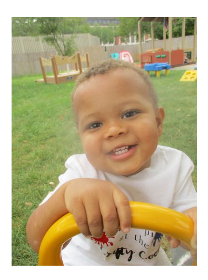
Standard: Children demonstrate interest and eagerness in learning about their world.