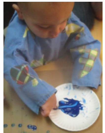
Painting our Card Board Clouds