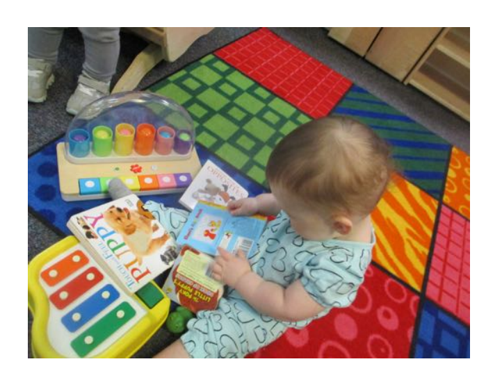
Standard: Children demonstrate interest in and comprehension of printed materials.