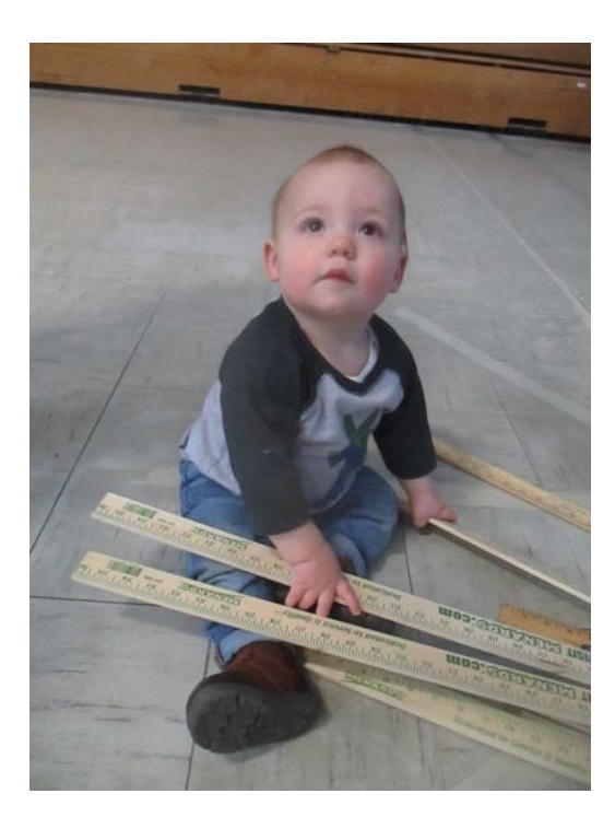
Standard: Children demonstrate the ability to acquire, store, recall, and apply past experiences.