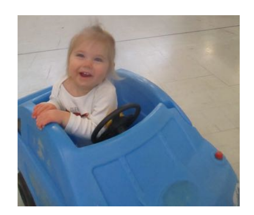
Have a Safe