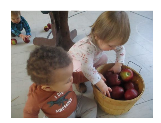
Standard: Children demonstrate the ability to use knowledge, previous experiences, and trial and error to make sense of and impact their world.