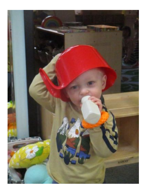
"Tell me and I forget. Teach me and I remember.