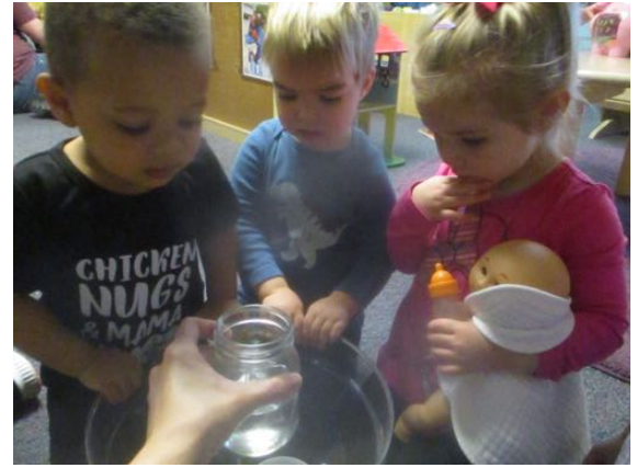
Our Experiments with Water, Sand, and Dirt

Standard: Children demonstrate a basic awareness of and use scientific concepts.