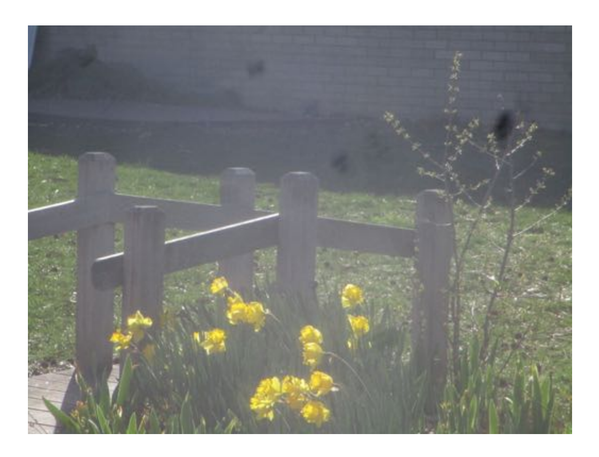
Have a Great Weekend! We Will See You Monday!