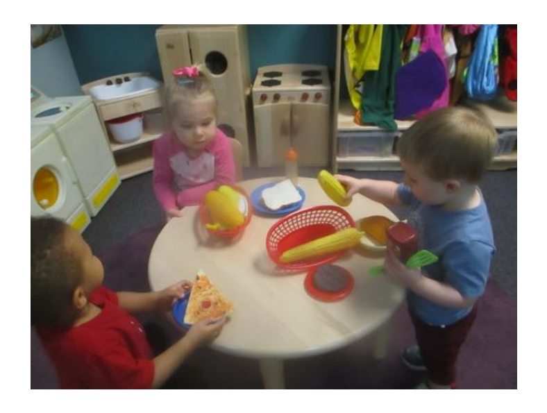
Exploring the Play Food in our House Keeping Center