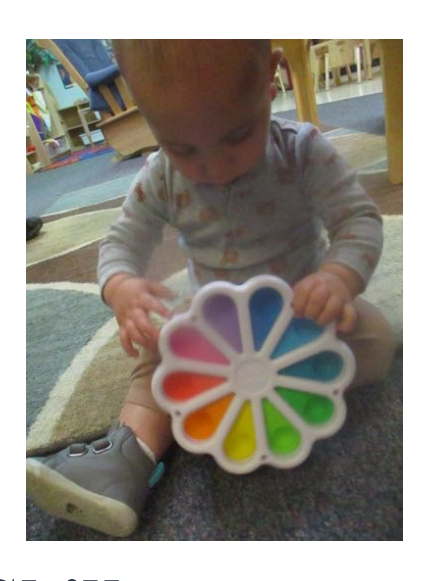
Using Our Problem-Solving Skills