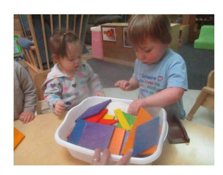
Exploring the Pattern Block Shapes