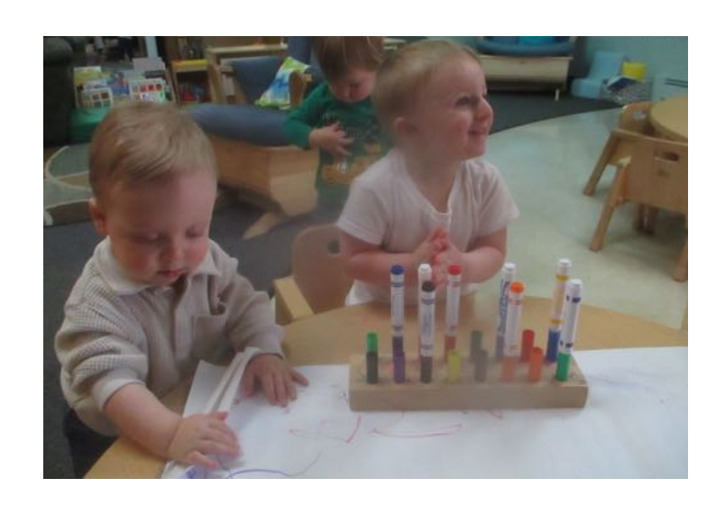
Exploring our Markers