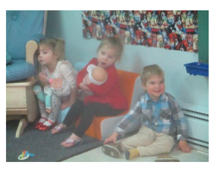
Singing to Our Baby Dolls