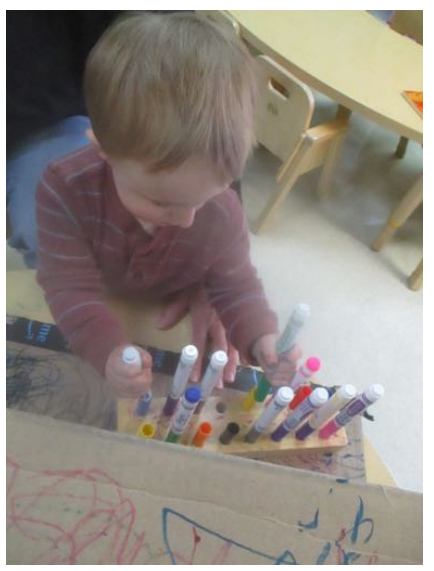
Coloring The Big Box