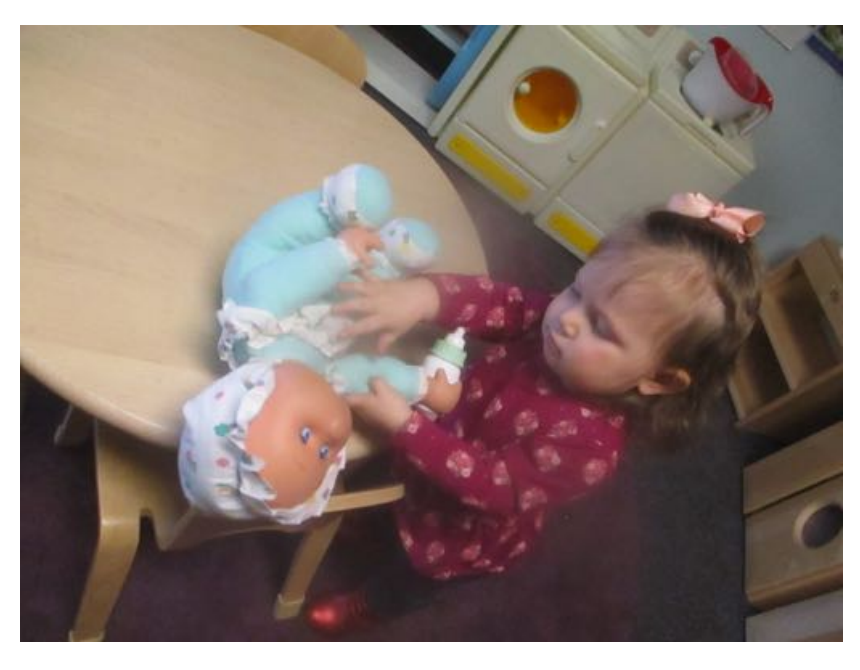
Taking Care of our Baby Dolls