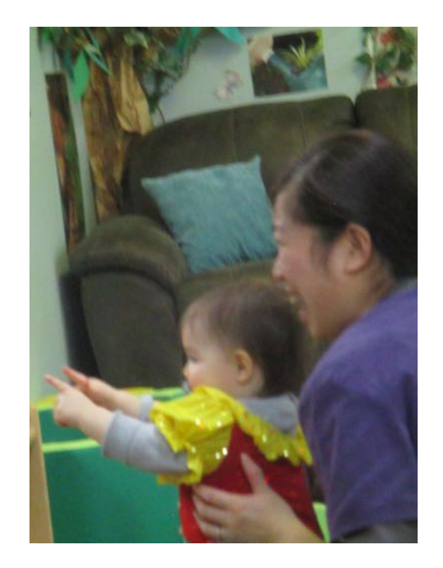
Exploring the Dress Up Costumes and Seeing Ourselves in the Mirror!