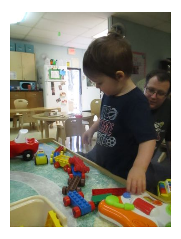
Standard: Children attempt a variety of strategies to accomplish tasks, overcome obstacles, and find solutions to tasks, questions, and challenges.