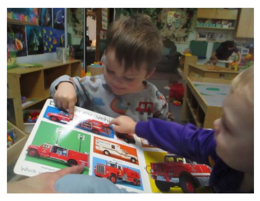
Standard: Children demonstrate interest in and comprehension of printed materials.