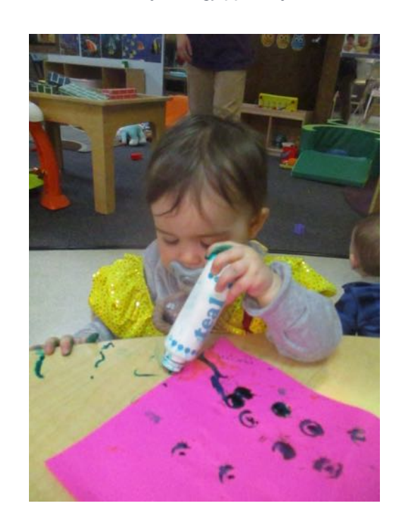
Creating Pictures with Paint Dots!