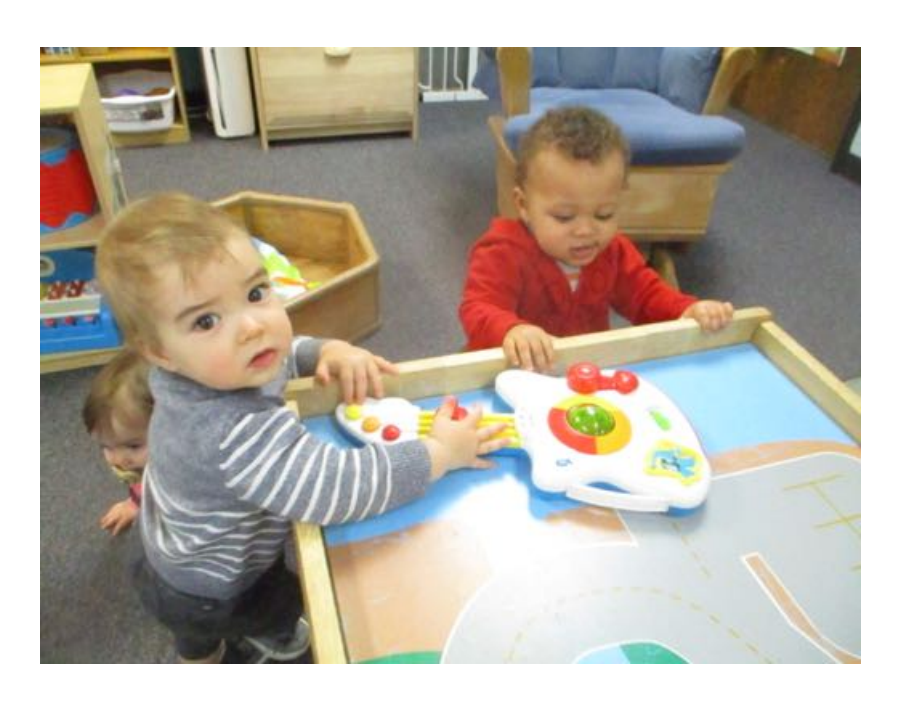
Exploring the Toy Guitars!