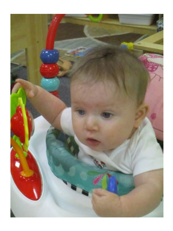
Using Our Muscles and Exploring the Gym!