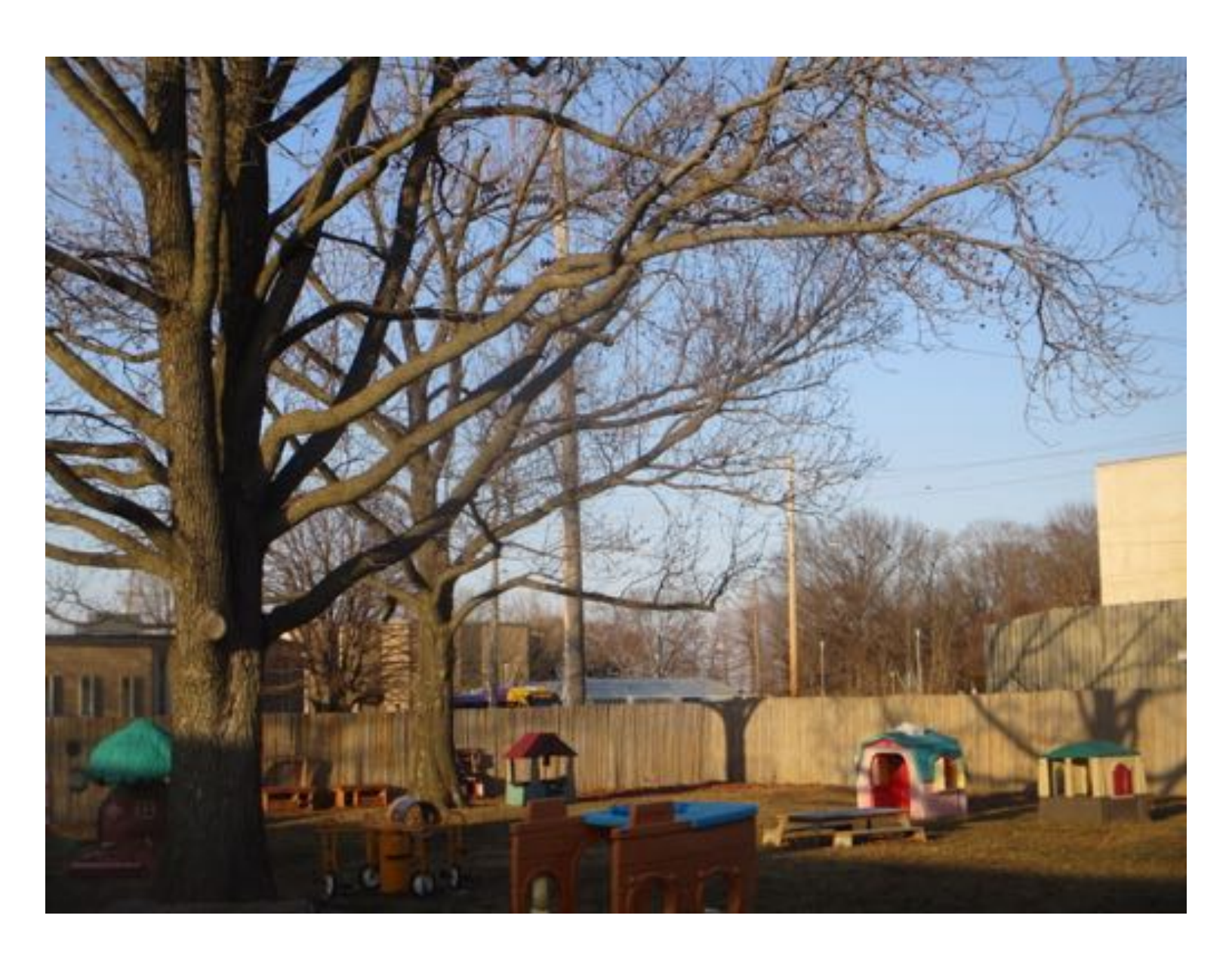
Have a Great Weekend! We Will Gee You on Monday!