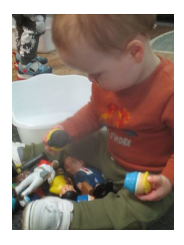
Exploring the Dollhouse People