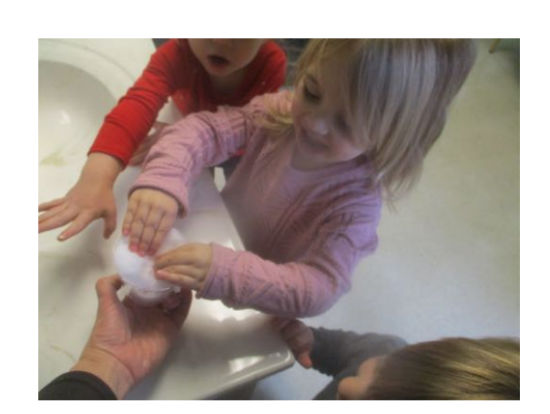
Discovering the Temperature of the Snow. Watching it Melt as it Falls into the Sink

Standard: Children demonstrate a basic awareness of and use scientific concepts.