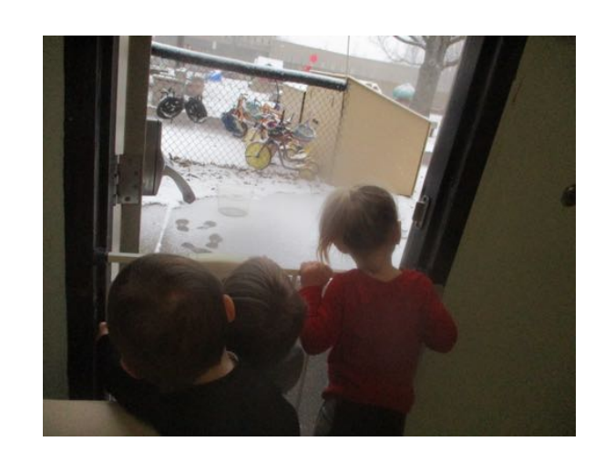
Placing an Empty Container Outside to Capture the Snowflakes