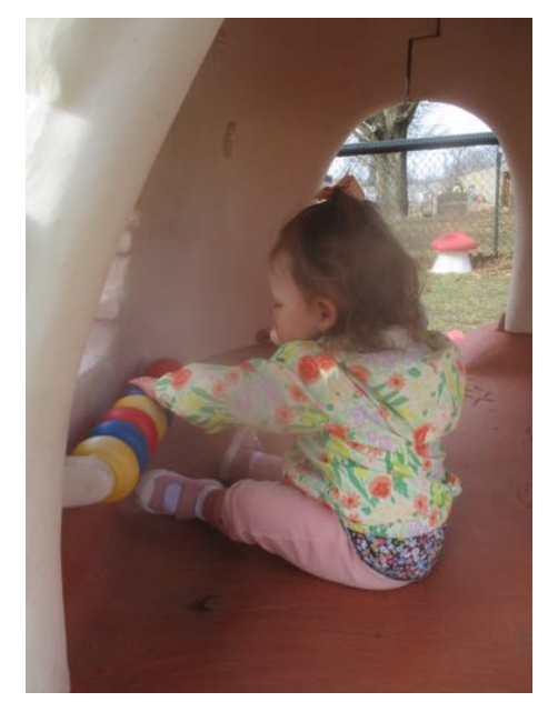
Playing Outside and Enjoying the Spring Weather