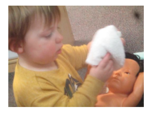
Standard: Children demonstrate the ability to engage with and maintain communication with others.