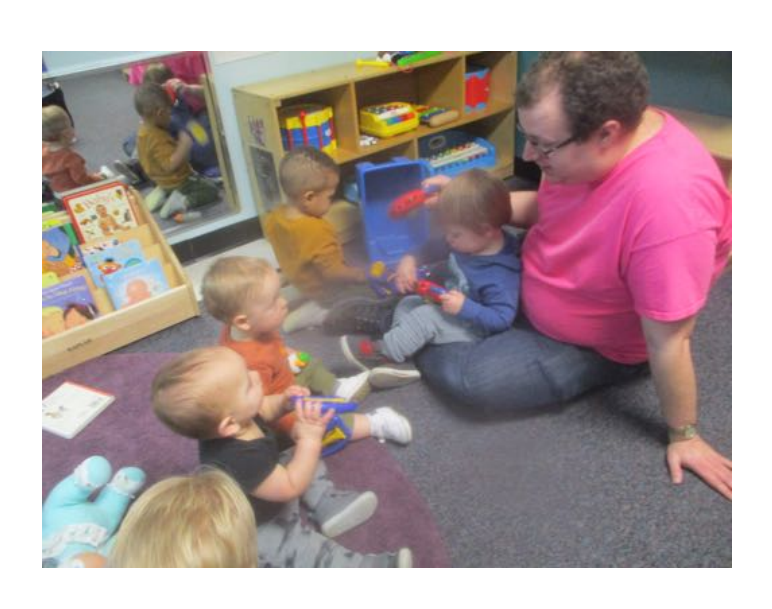
Singing Songs with Our Friends