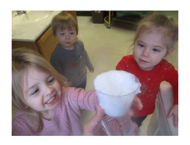
Collecting a Cup Full of Snow