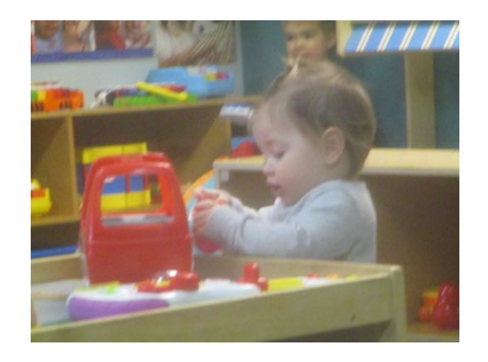
"Let the Child be the Scriptwriter, the Director and the