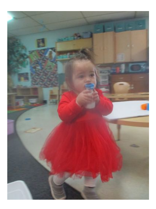
Exploring Dishes in the Play Kitchen