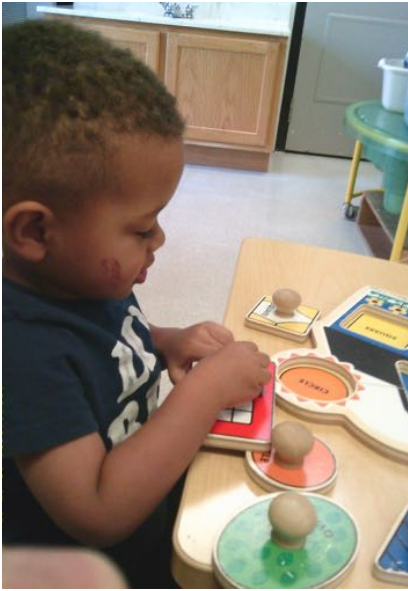
Putting Together Puzzle Pieces