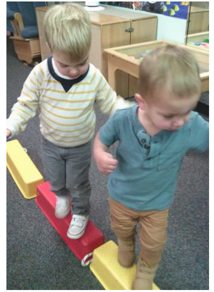
Walking on the Balance Beam