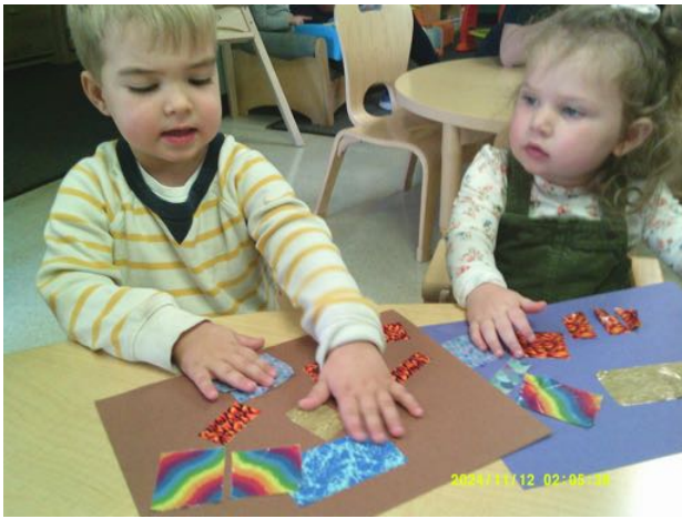
Creating Pictures with Sticky Tape