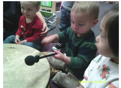
Playing on the Gathering Drum

Standard: Children demonstrate an awareness of and the ability to identify and express emotions.