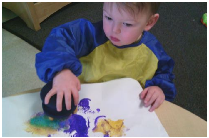
Creating Pictures with Sponges and Paint