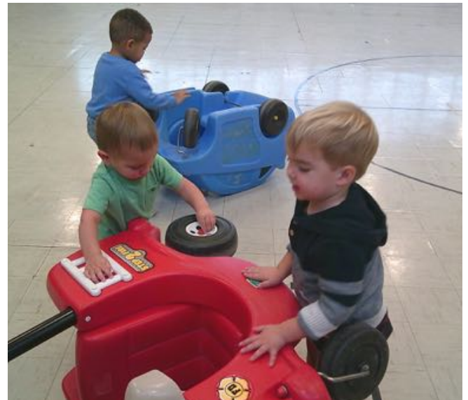
Repairing Our Toy Cars

Children demonstrate the ability to connect pieces of information in understanding objects, ideas, and relationships.