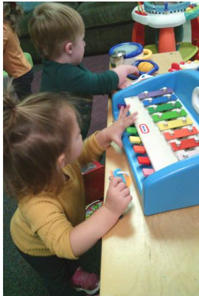
Creating More Music and Pictures to Share!