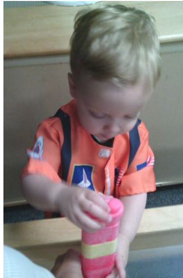
Stacking our Blocks