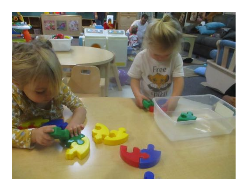
Putting Together Puzzle Pieces and Talking About our Colors