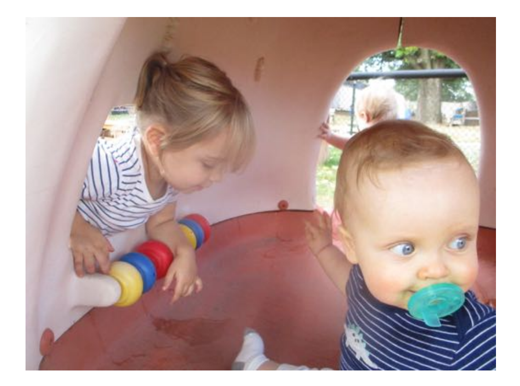
Talking with Friends in the Mushroom House