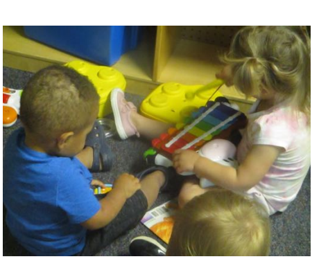
Sharing Songs with Our Friends