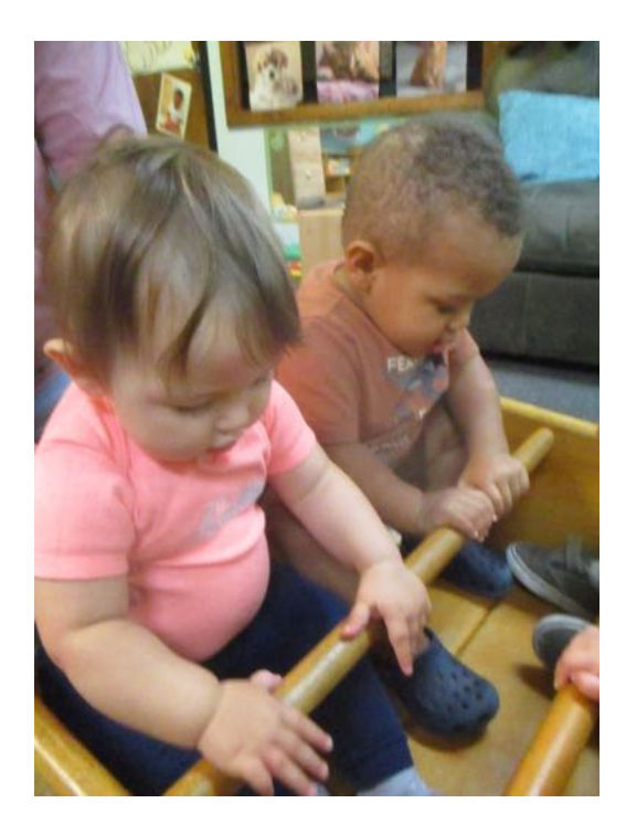
Singing Songs in our Row Boat