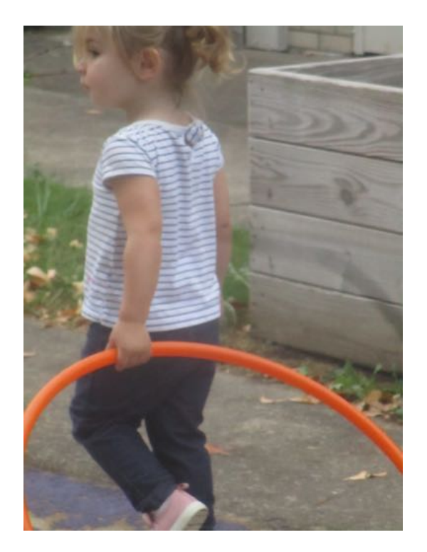
Playing with our Hula Hoops after Talking About Circles