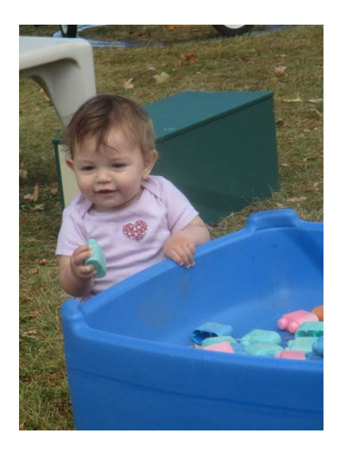
Exploring the Stacking Blocks