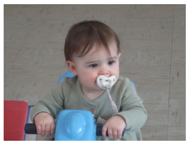
Look at Us Go!