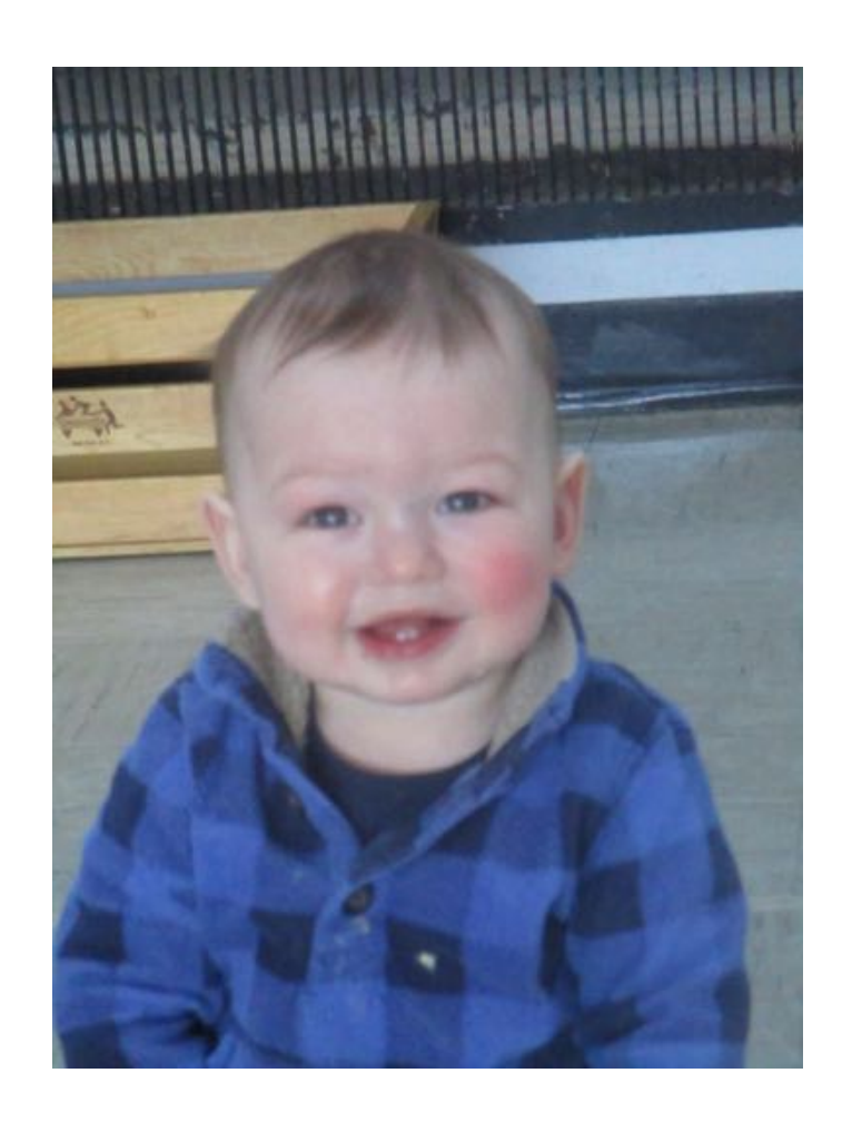
Enjoying Our Gym Time with Our Friends