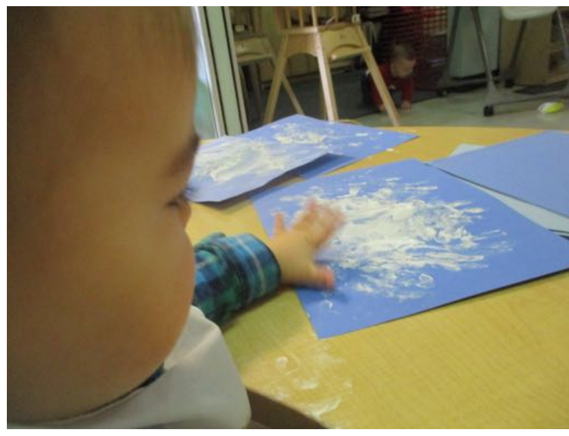
Exploring Paint to Create our Snow Pictures