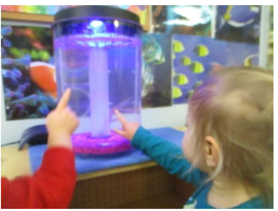
Observing our Classroom Fish