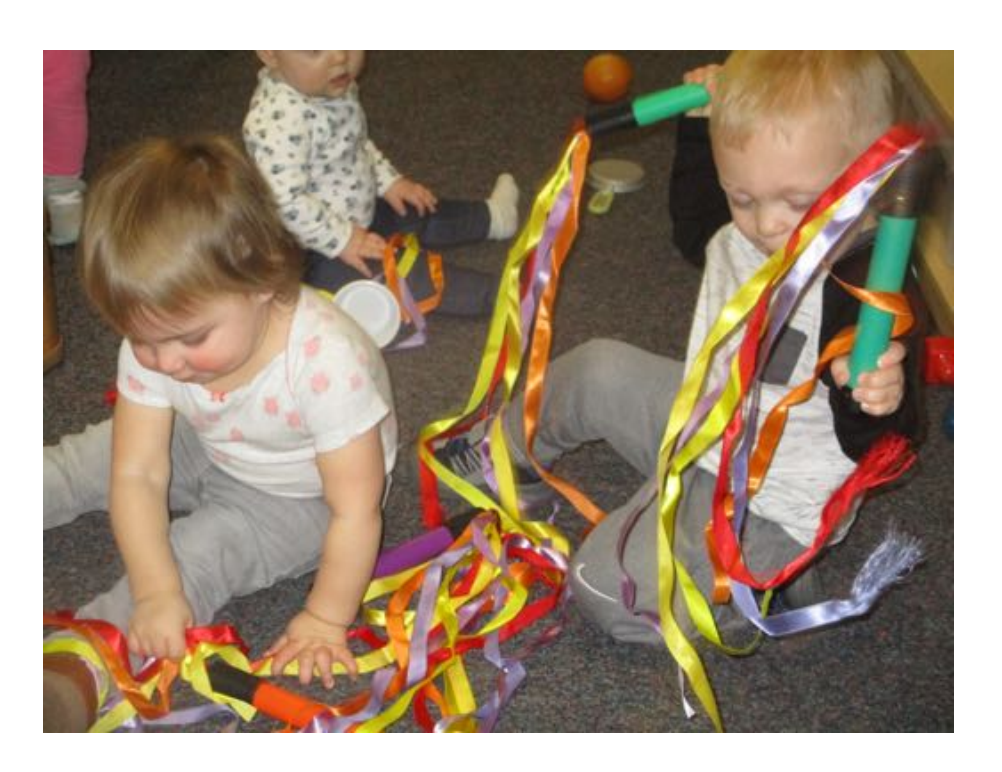
Standard: Children demonstrate the ability to convey ideas and emotions through creative expression.