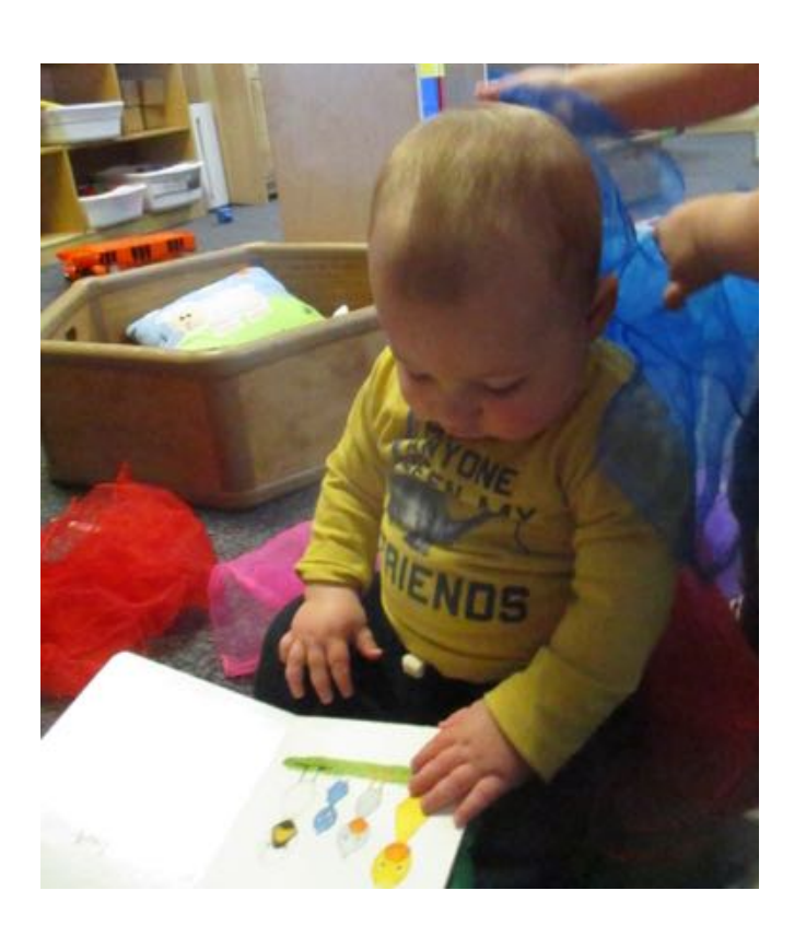
Exploring Our Books