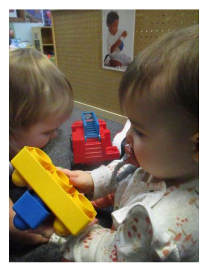
Standard: Children demonstrate the ability to engage with and maintain communication with others.