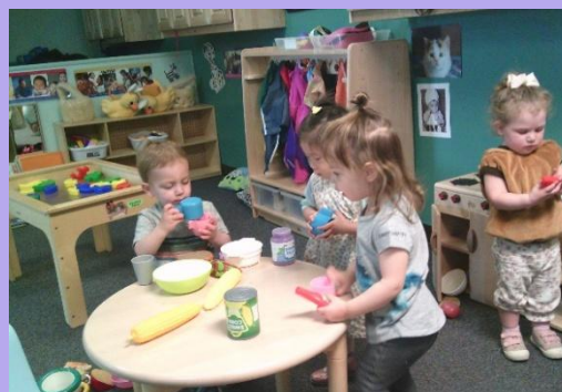
Sharing Play Food and Exploring the Dress Up Clothes