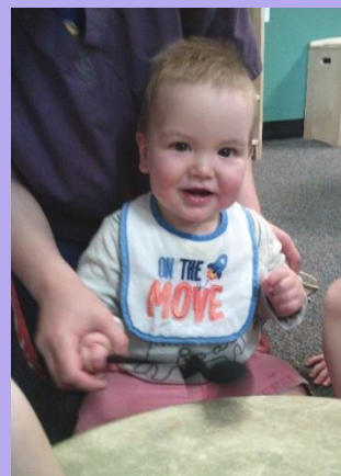
Playing the Gathering Drum