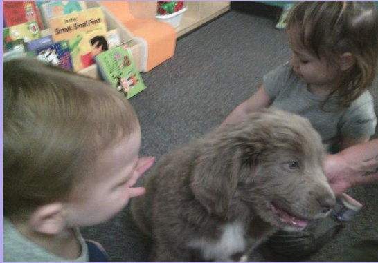
Enjoying a Visit with Wendy the Puppy