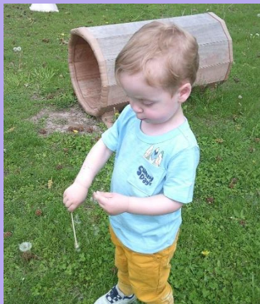
Discovering Dandelion Seeds