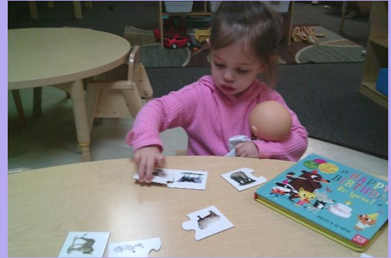
Matching the Animal Puzzle Pieces