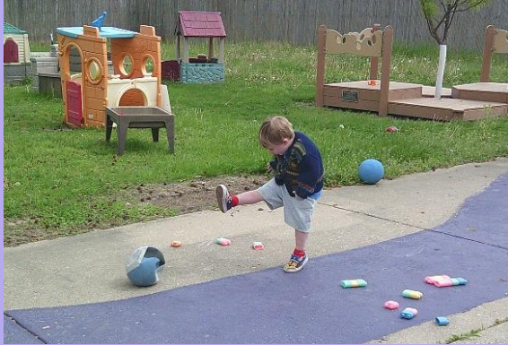
Kicking the Ball and Using our Muscles