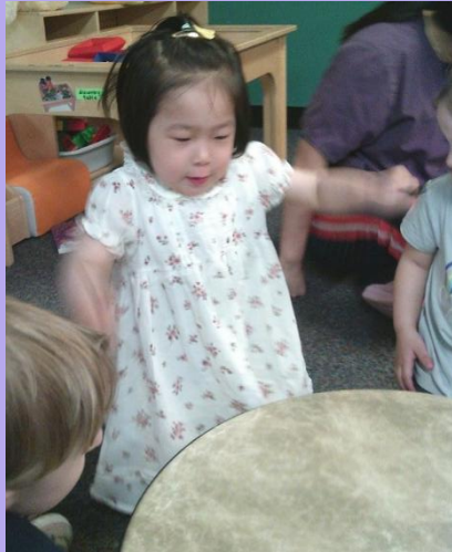
Sharing More Songs with the Gathering Drum