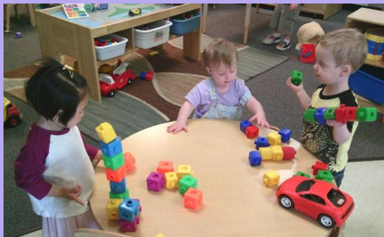
Stacking the Locking Blocks