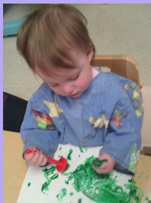
Painting with the Stampers