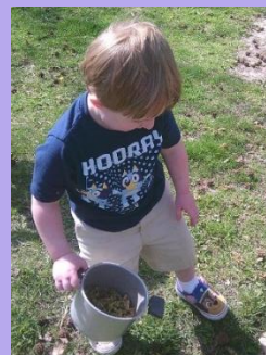
Exploring the Pots and the Pans