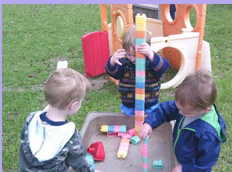
Creating Block Towers Outside on the Playground