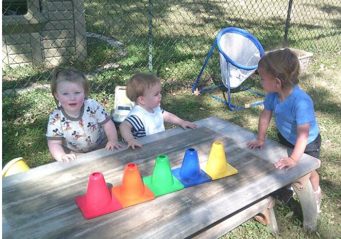
Exploring Our Colors and the Outdoor Cones