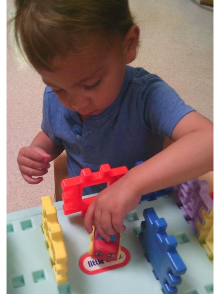
Building with Our Waffle Blocks