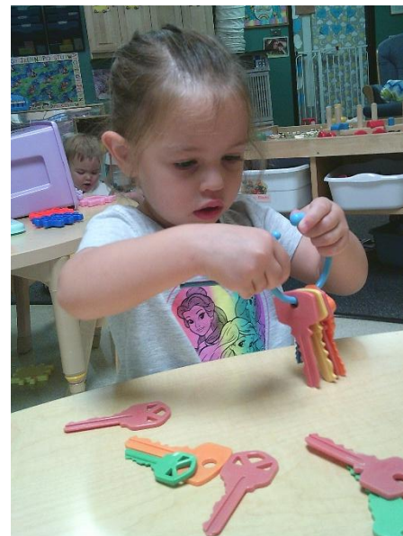
Utilizing Our Fine Motor Skills