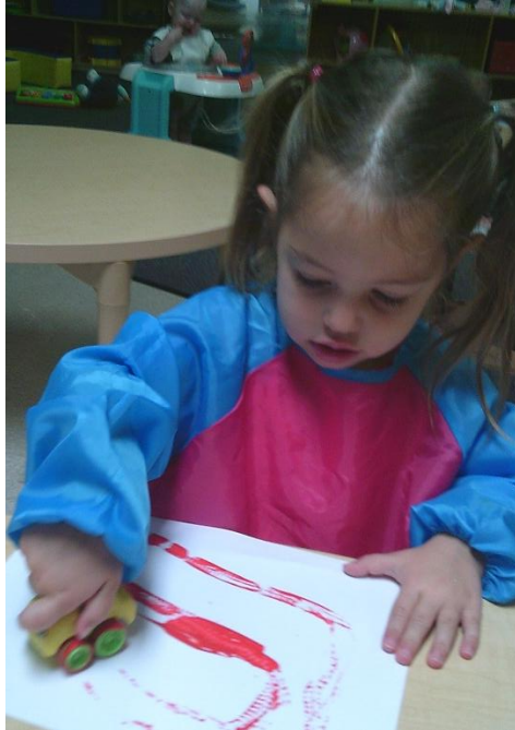
Painting with our Cars