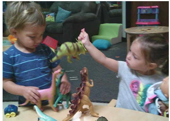
Discovering the Toy Dinosaurs