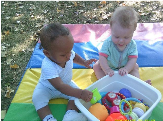
Playing with Our Friends