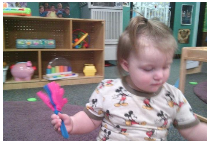
Sharing Songs and Our Clapping Instruments

Standard: Children demonstrate the ability to use knowledge, previous experiences, and trial and error to make sense of and impact their world.