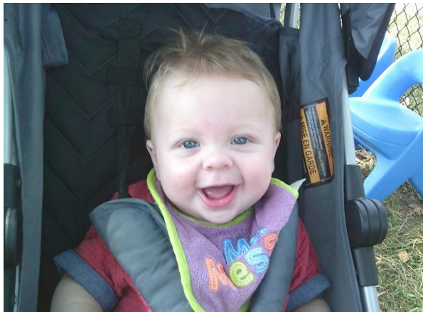
Enjoying a Stroller Ride