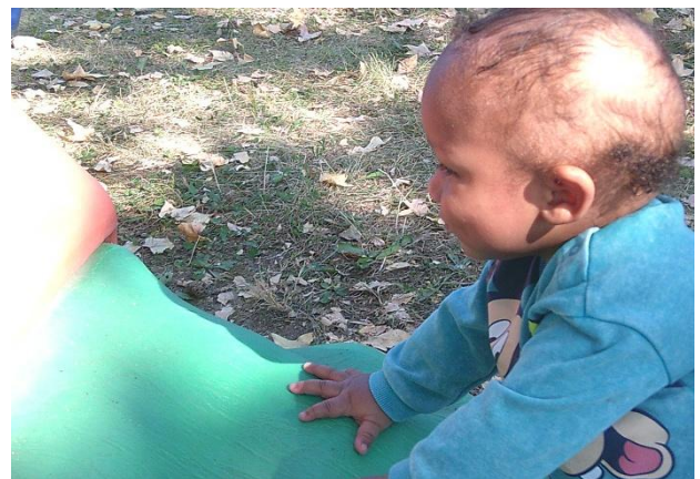
Discovering Our Playground

Enjoy Your Weekend! We Will See You on Monday!