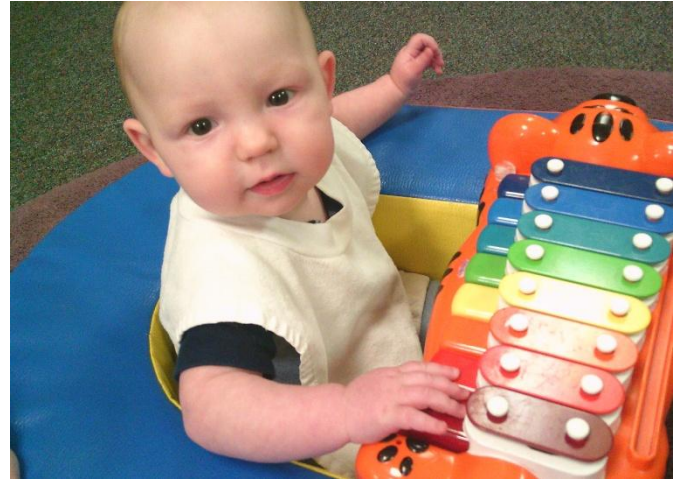
Exploring the Keyboard