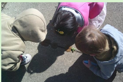
Discovering the Ant Hills