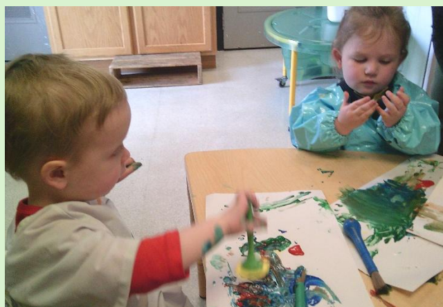
Exploring the Paint with Rollers and Sponges