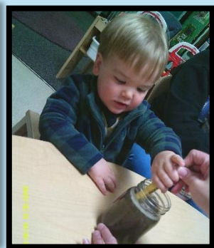
Observing What Occurs When We Add Sand and Mud to our Water Jar!