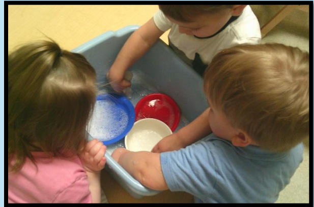
Washing our Toy Dishes