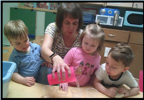
Exploring the Concepts of “Empty” and “Full”