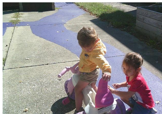
Hiding Our Sidewalk Chalk