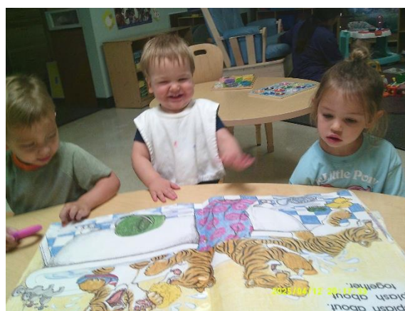
Sharing Big Books