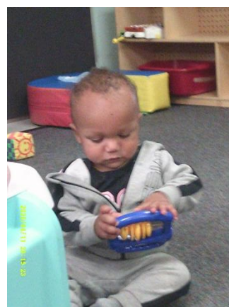
Discovering Sand, Stuffed Animals, and Instruments!