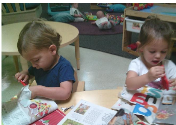
Discovering Glue and Safety Scissors