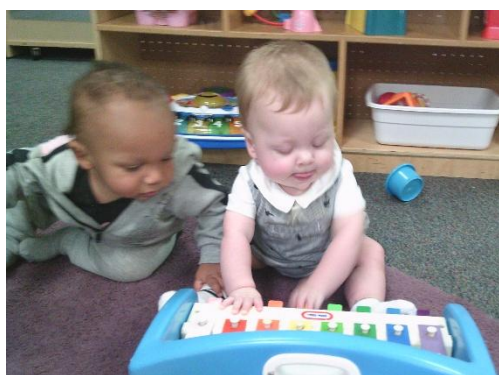
Exploring the Toy Piano