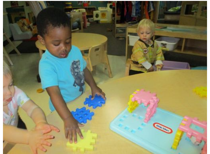
Building with the Waffle Blocks!