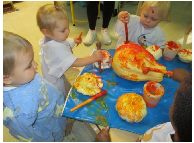
Painting our Gourds!