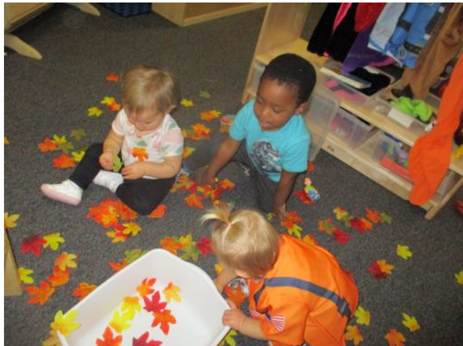
Exploring Fall Leaves and Singing Songs about Autumn