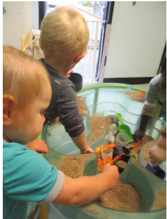
Discovering Leaves in the Sand Table

Standard: Children demonstrate the ability to coordinate their small muscles in order to move and control objects.