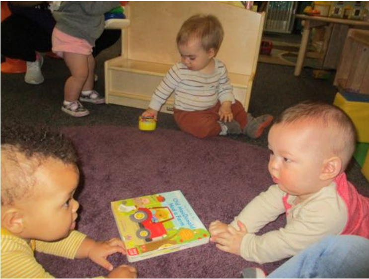
Sharing a Board Book and Enjoying Tummy Time!