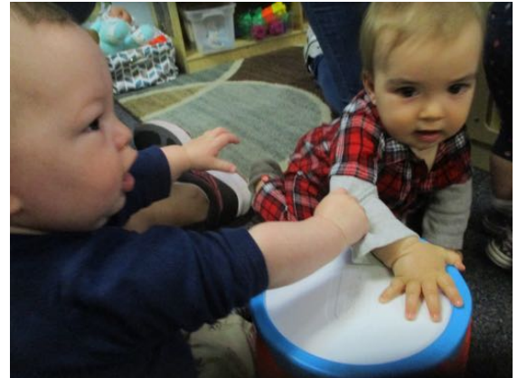
Exploring Musical Instruments