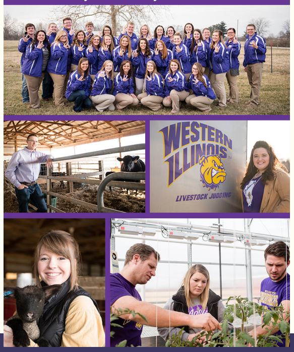
WESTERN ILLINOIS UNIVERSITY A hands on education at your home away from home.

If you have news that you want to be included in next week's Aggie 'Neck News or have questions about this issue, please email kl-graves@wiu.edu