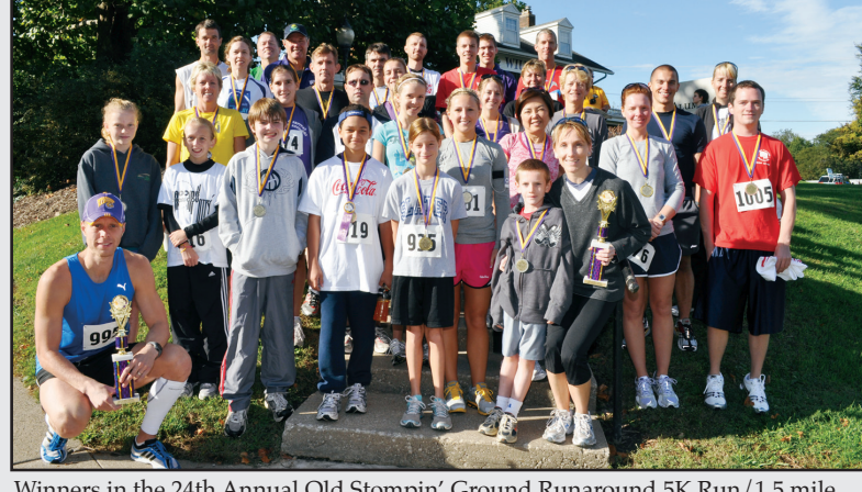
Winners in the 24th Annual Old Stompin' Ground Runaround 5K Run/1.5 mile