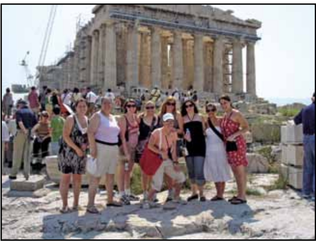
Students in Crete

Next up, Volunteer Services is sponsoring the annual Alternative Spring Break trip from March 14-22. Two cosite leaders and two graduate assistants will accompany 11 students to Biloxi (MI) to work with Hurricane Katrina relief. These students work for months planning their trip. They choose the site, raise money to fund their trip and participate in team-building activities. By the time they travel together, they are a cohesive unit, ready to make an impact on the community they have chosen to serve.