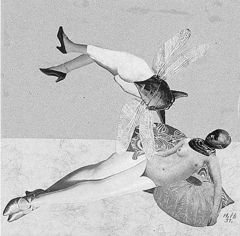
Figure 3. Hannah Höch, Liebe , 1931. © 2014 Artists Rights Society (ARS), New York / VG Bild-Kunst, Bonn.