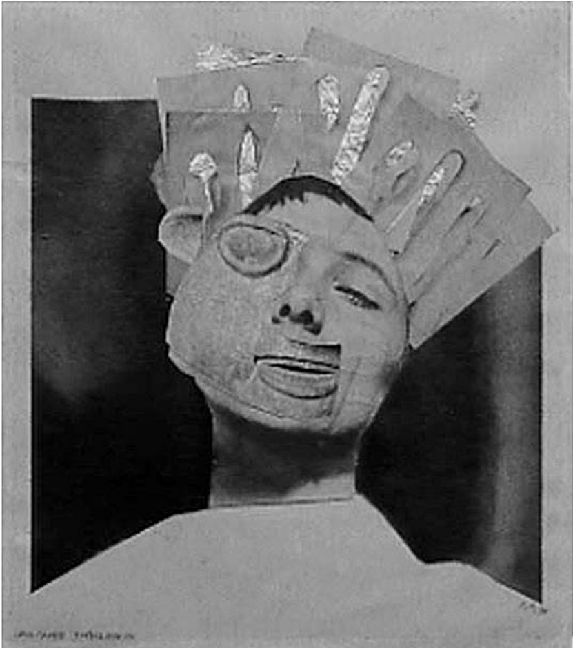
Figure 2. Hannah Höch, Indische Tänzerin , 1930.