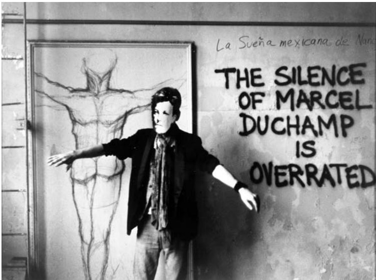
Figure 5. David Wojnarowicz, Arthur Rimbaud in New York (Duchamp) , 1978–79. Gelatin-silver print, 8 × 10 inches. 3 .